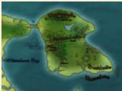
The Lands of Runelore