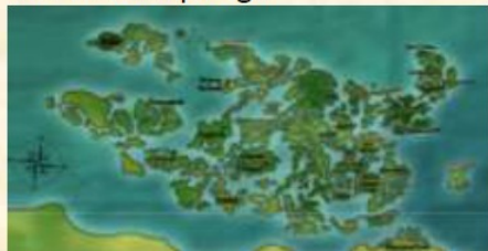
The PC Archipelago