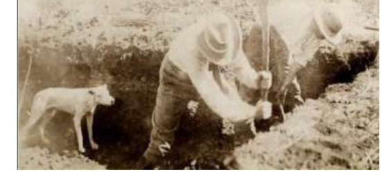
Seeking old records requires help!

So PLEASE review the reports when they are issued and let me know as soon as possible if there are any corrections that need to be made. I'm happy to correct any and all errors, but please don't wait more than one year to make those requests!