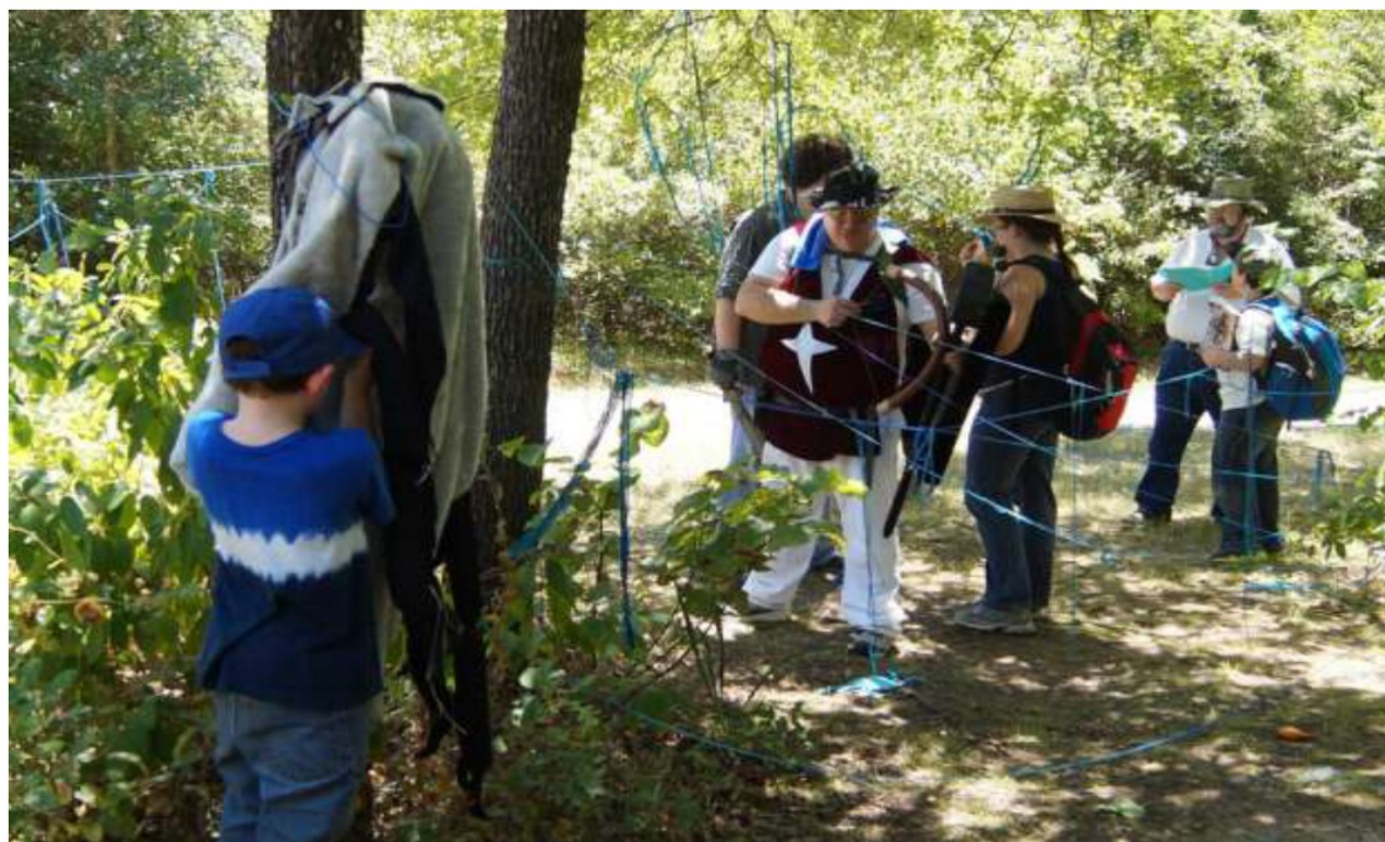
Team #3 meets the Frost Vines